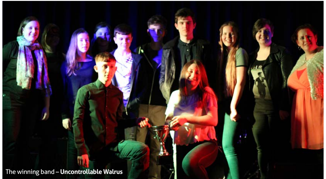
The winning band – Uncontrollable Walrus